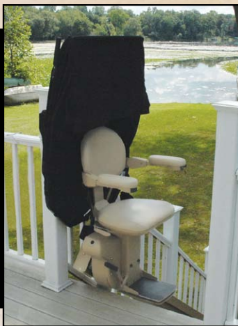
OUTDOOR ELECTRA-RIDE™ ELITE Model SRE-2010E

Home accessibility solutions and automotive products