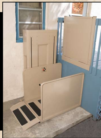
VERTICAL PLATFORM LIFT

The only 400 lb/181.8 kg capacity outdoor stairlift... an INDUSTRY EXCLUSIVE!