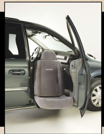
TURNING AUTOMOTIVE SEATING™ (TAS™)

Founded over 20 years ago, Bruno Independent Living Aids, Inc., is a world-wide manufacturer of accessibility products designed to enhance the lives of those challenged by limited mobility. In pursuing this goal, Bruno is proud to be the only U.S. manufacturer of indoor/outdoor stairlifts, interior/exterior scooter, powerchair and wheelchair vehicle lifts and Turning Automotive Seating™ (TAS™) products to be ISO 9001 Certified. This is one of the most stringent, widely-recognized quality standards in the world and your assurance that Bruno is committed to providing you with the highest-quality, most reliable products in the industry. Ask your certified Bruno dealer for details on all Bruno independence products.