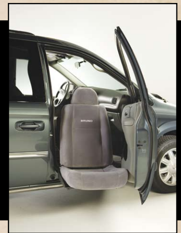
TURNING AUTOMOTIVE SEATING™ (TAS™)

Founded 25 years ago, Bruno Independent Living Aids, Inc., is a world-wide manufacturer of accessibility products designed to enhance the lives of those challenged by limited mobility. In pursuing this goal, Bruno is proud to be the only U.S. manufacturer of indoor/outdoor stairlifts, interior/exterior scooter, powerchair and wheelchair vehicle lifts and Turning Automotive Seating™ (TAS™) products to be ISO 9001 Certified. This is one of the most stringent, widely-recognized quality standards in the world and your assurance that Bruno is committed to providing you with the highest-quality, most reliable products in the industry. Ask your certified Bruno dealer for details on all Bruno independence products.