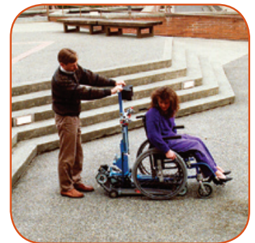
Ascend or descend stairs with the press of a button. The passenger sits in a comfortable, upright position.