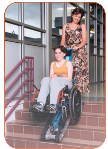
Stair-Trac will climb virtually any stair tread material.