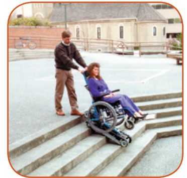
Attach the Stair-Trac to the wheelchair, recline the passenger and move them to the stairway.